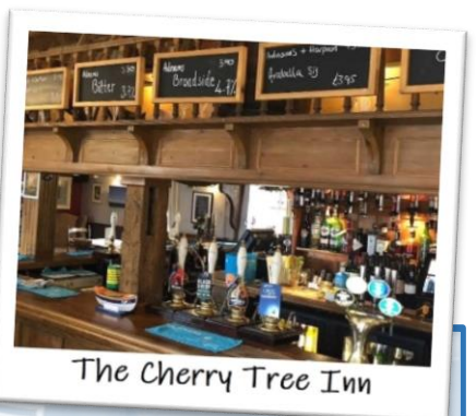
The Cherry Tree Inn